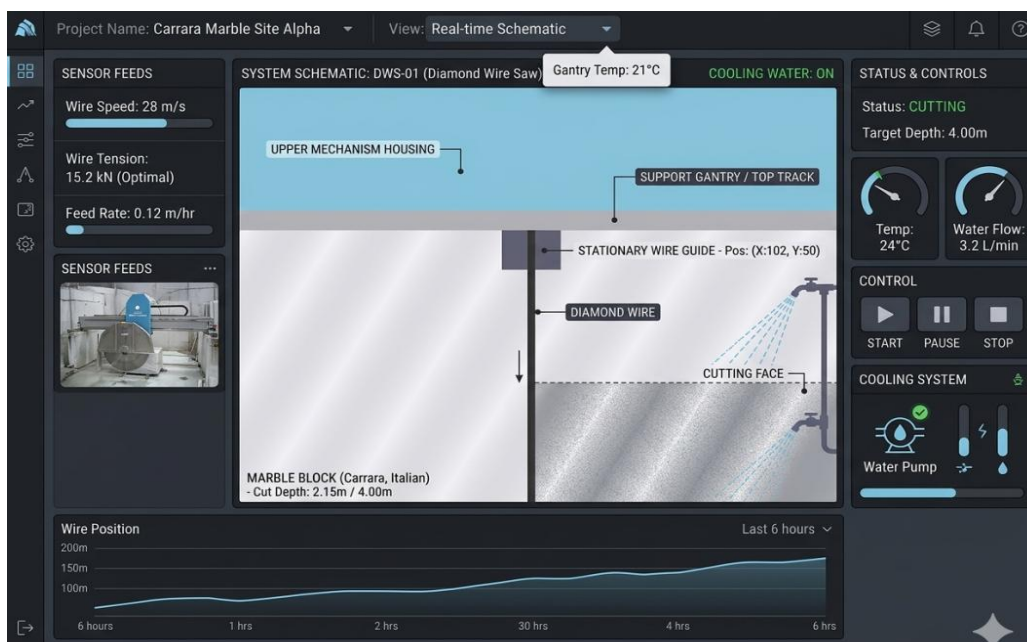
Figure 1. Diamond wire saw system in operation at a marble quarry – continuous wire cutting method with water cooling

The wire diameter typically ranges from 10 to 12 mm, and the diamond bead concentration varies from 35 to 45 carats per meter depending on the marble hardness (Mohs hardness 3–4). A water-cooling system is integral to the operation, preventing thermal damage to the wire and flushing cuttings from the kerf.