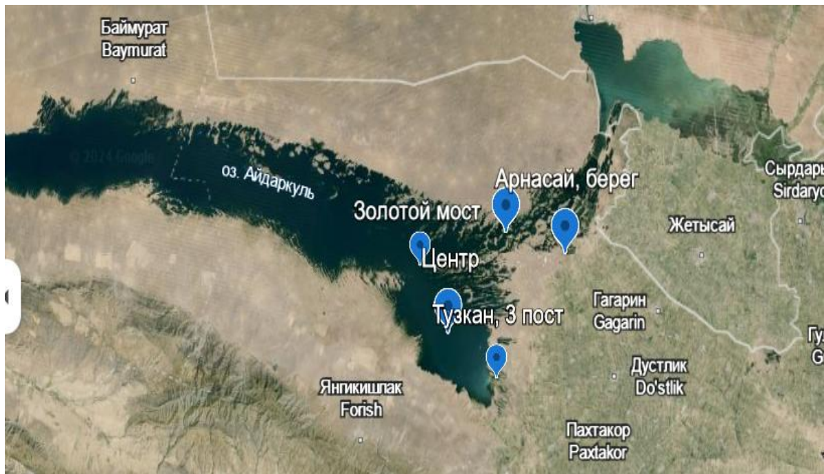
Figure 1. Sampling points on Arnasai and Tuzkan islands, August 2024.

The results of the analyses to determine water salinity are presented in the table.