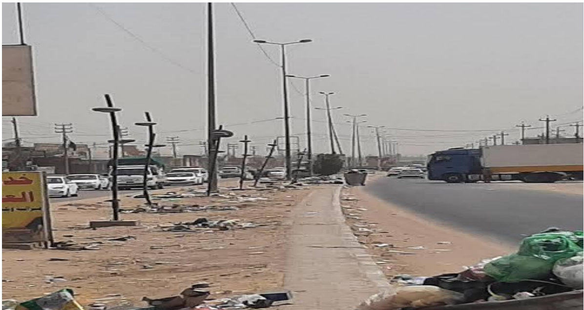
Source: Field photograph of one of the private electrical generator sites and a waste dump in Najaf City, 2025