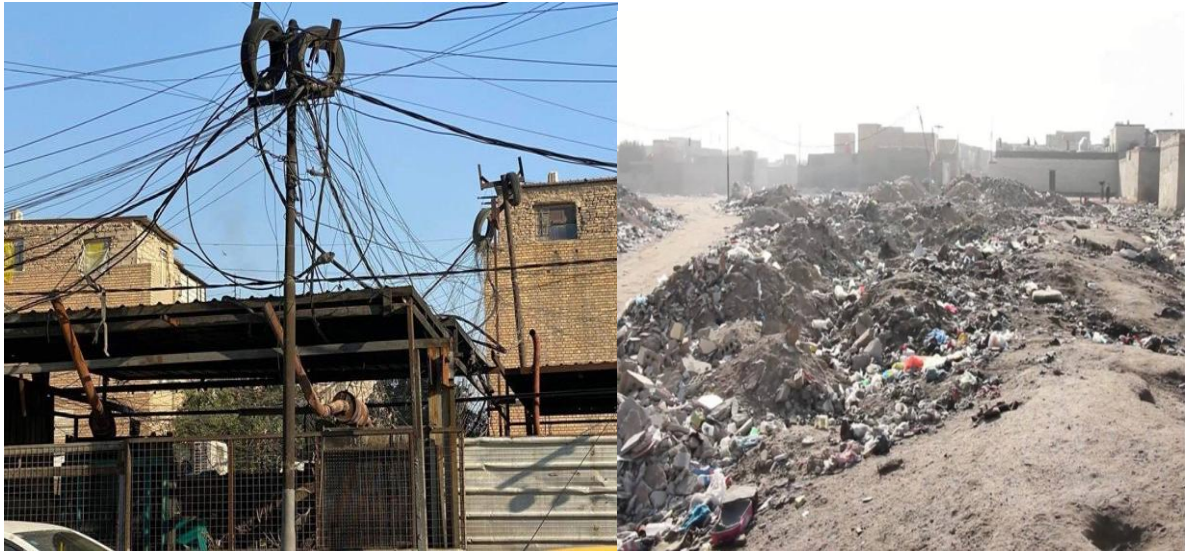
Source: Field photograph of one of the private electrical generator sites and a waste dump in Najaf City, 2025.

agricultural areas, resulting in water contamination. Over time, the health risks increase in densely populated neighborhoods and areas near waste sites and power generators.